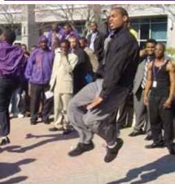
Brothers Steppin' High