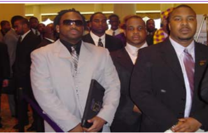
Undergraduates in the registration line.