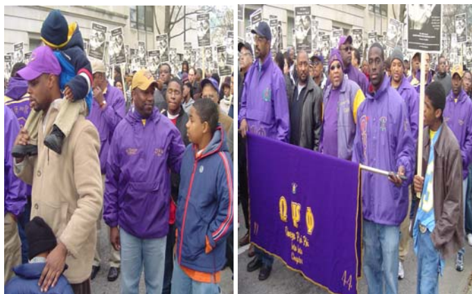
Brothers and their sons.

Please remember to keep the King family in your thoughts and prayers as Mrs. Coretta Scott King has gone on to be with her husband and many other fallen civil rights leaders that have shaped the course of not only Black history, but American history.