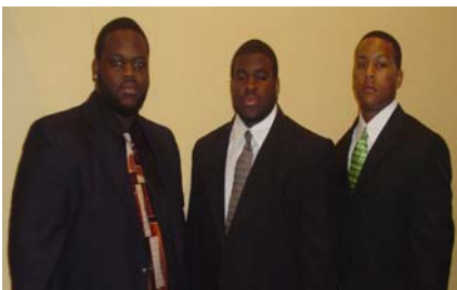
Delta Psi & Kappa Epsilon represented.