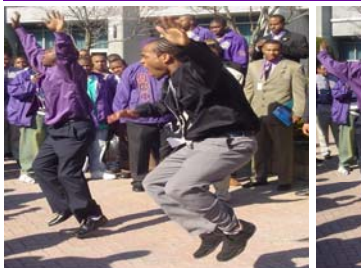
Who sets out the best hops?